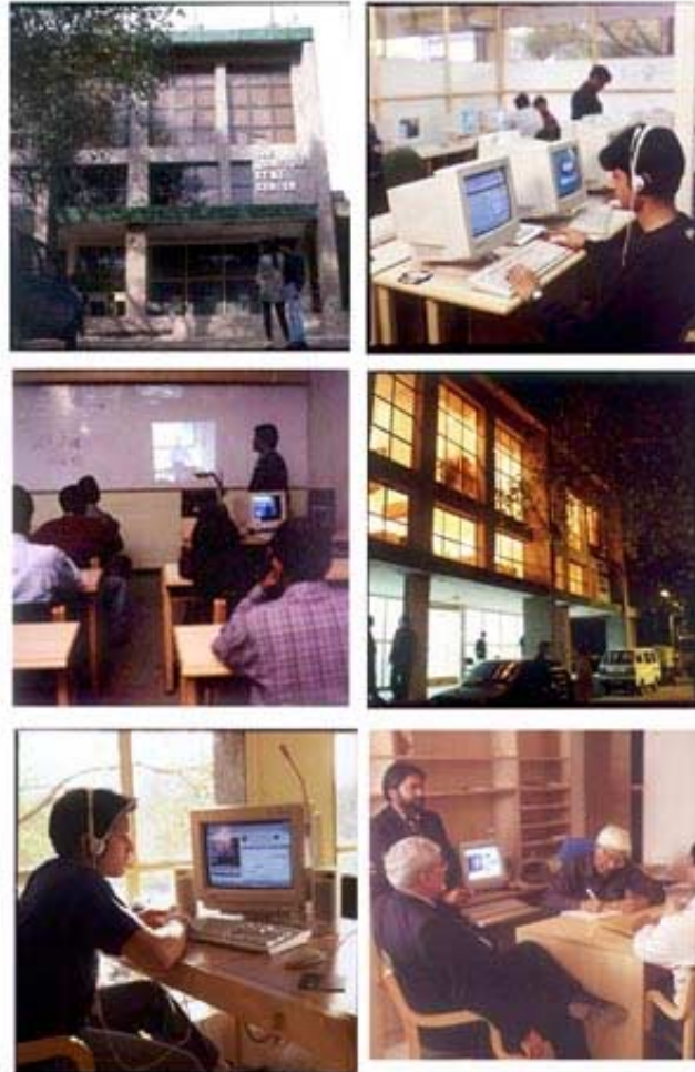
New Delhi Site