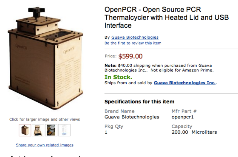
Figure 2: A low-cost thermocycler

Consider the polymerase chain reaction (PCR). This is a technique for high volume replication of DNA, the molecule that encodes the genetic programming for all known life, including most viruses. PCR requires a series of carefully calibrated temperature changes over a period of time. Such a process is enabled by a device called a "thermocycler", which is basically a high-precision, programmable oven. If you would like to try it in the comfort of your home, you can purchase a kit (Figure 2) for $599.00 at <u>Amazon.com</u>. For safety, please replicate only harmless DNA.